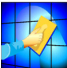
CETOFILL for ceramic joint filling